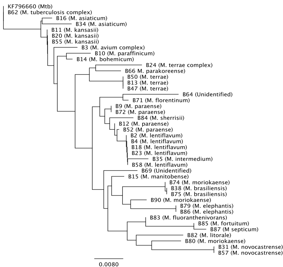
Fig. (3). The 16S rRNA gene-based phylogenetic tree analysis of the 41 non-MAC species. The tree was rooted with Mtb sequence (Accession number KF796660). B3 was used as a representative of the MAC species.

19]. People who have HIV/AIDS have a higher risk of getting infected [20]. Generally, infections due to Mycobacterium tuberculosis and MAC are the most commonly reported in HIV/AIDS patients [21, 22].