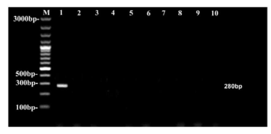
Fig. (3). Agarose gel electrophoresis of amplified products with CT0005-CT06 primer. DNA marker is in the left outside lane. Lane 1 (I15) shows amplified product of 280bp.

The use of Nucleic acid diagnostic techniques such as polymerase chain reaction (PCR) has revolutionized our ability to diagnose almost all the microbes including genital tract Chlamydia trachomatis infection in minimum time with stringent specificity. Sensitivity and specificity of this test on FVU sample have been proven comparable to those obtained on samples collected directly from cervix or urethra [26]. Moreover, FVU sample collection is noninvasive, more acceptable to patients and does not require help of medical personnel to perform vaginal speculum examination which is